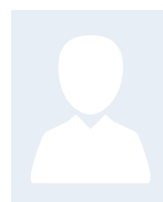
Tania Wopech, NP